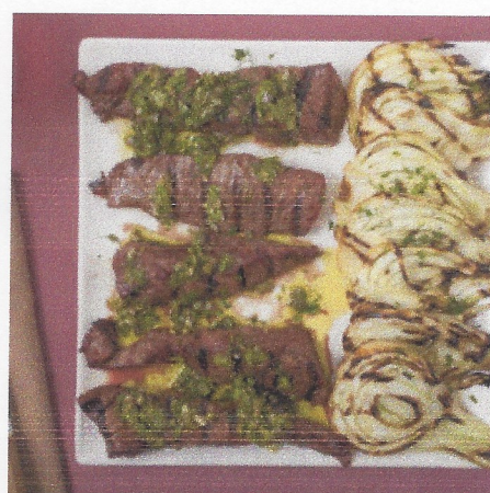
Grilled Steak and Cabernet Sauvignon Pairing