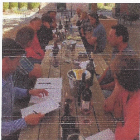
Will A New Appellation Boost Santa Barbara Cab?